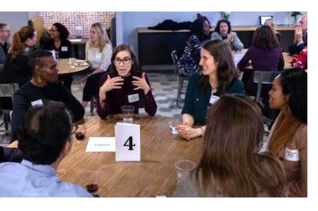
Sessions are designed to encourage every participant to form at least one meaningful, new connection who will support their career.

An adaptation of the successful Women inPower Fellowship model, the sessions will address the most urgent opportunities and challenges for women as they rise to the highest levels of leadership.